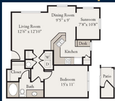
A2 - 1x1 - 773 sq ft