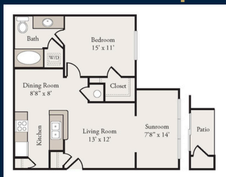
A1 - 1x1 - 636 sq ft