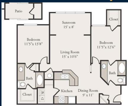
B2 - 2x2 - 1247 sq ft