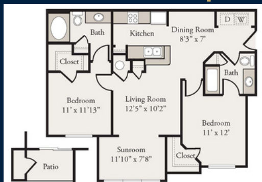
B1 - 2x2 - 1018 sq ft